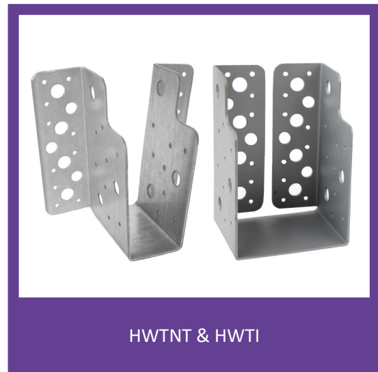
HWTNT & HWTI