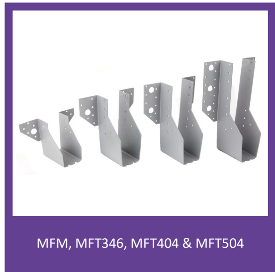
MFM, MFT346, MFT404 & MFT504