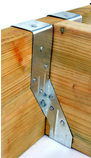
WNT in situ